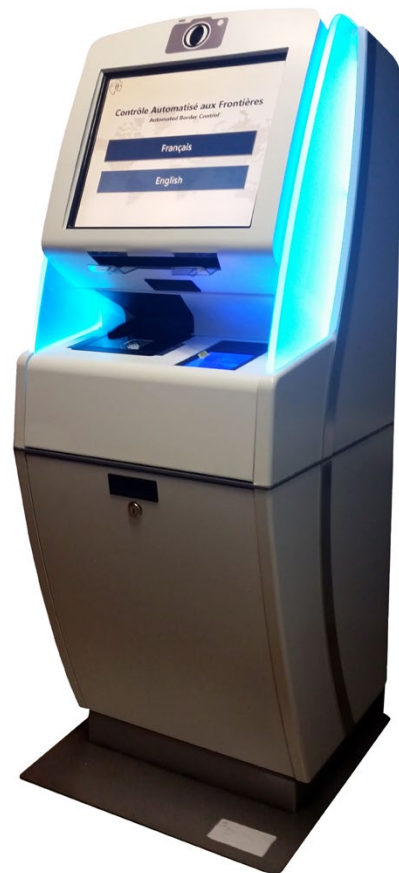
Self-service kiosks are now in use at Libreville International Airport

The Border Intelligence module uses the data mined at the border. It offers investigation tools for discovering new risk patterns, with a highly intuitive "clicking" process. Its reporting app also provides valuable information to drive tourism and prioritize national investment efforts.