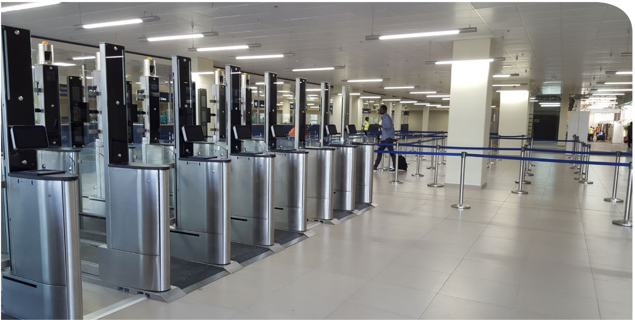
Ten e-gates are in use at the Kotoka International Airport in Accra, the capital of Ghana, as part of its current redevelopment. The e- Gate automatically scans traveler's passports and allow them access as part of immigration processes at the airport.