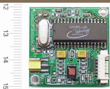
Prox - Module