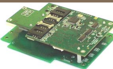
GemProx - CU