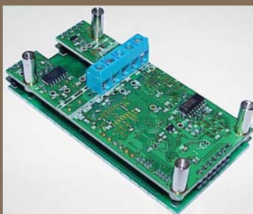
Prox - C2, - C5, - CW

This is the result of the unique addition of skills coming from several Gemalto laboratories.