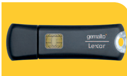
SMART ENTERPRISE GUARDIAN

Smart Enterprise Guardian is a unique USB device based on industry standards that secures identity credentials and sensitive files with proven smart card technology. In addition to